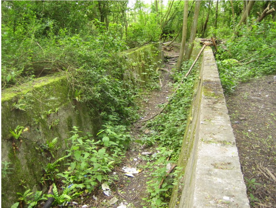
Left: Remains of the Burham Brick, Lime and Cement works.

conducted by an architectural consultant, although there will be opportunities for volunteers to participate in the fieldwork too. Again the plans will be mounted on the website as an interactive three-dimensional model of the works, with different layers representing different periods in the plant's development. There will, for instance, be links to both archival photographs, and more modern images showing the site as it appears today. This again will provide a useful source of information on an aspect of life in the valley which is fast disappearing from living memory, and a feature of the historic landscape soon to disappear under the bricks and mortar of redevelopment.