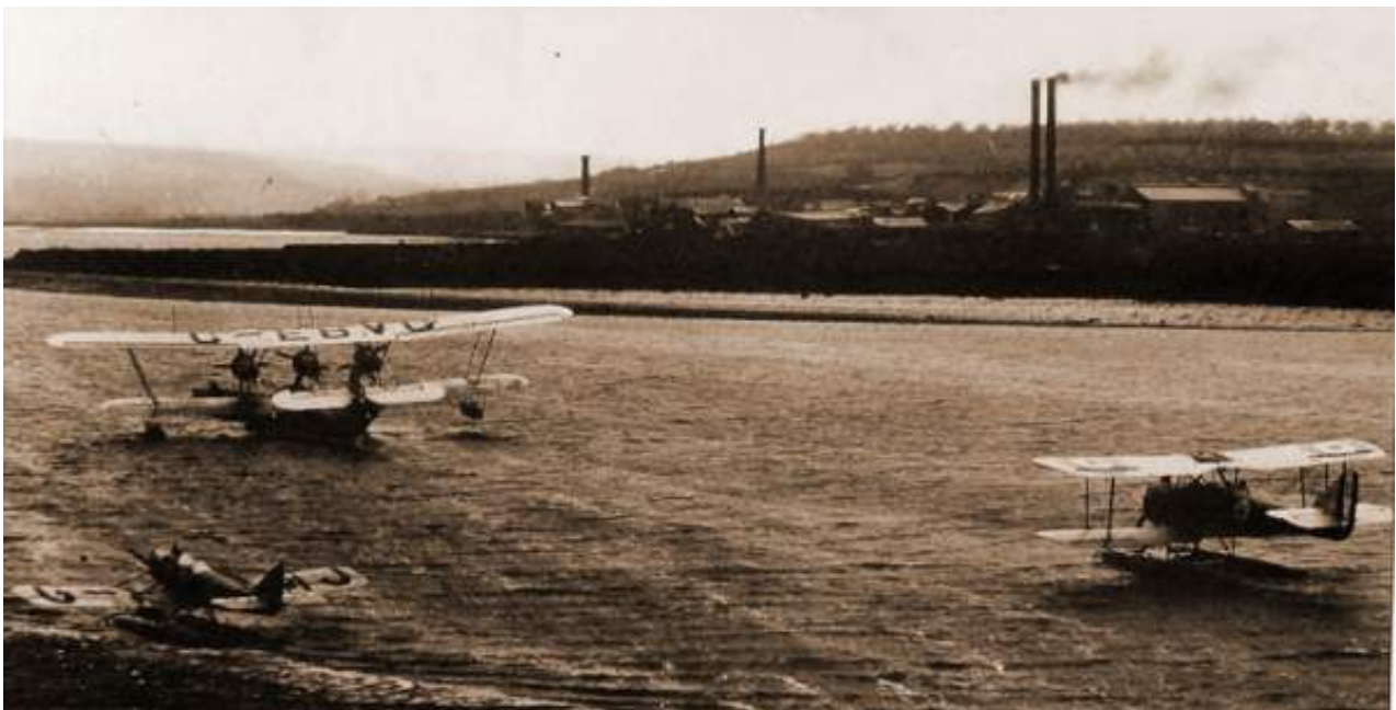
The River Medway at Rochester, February 1928. Anchored were (left) the Mussel I G-EBMJ and (right) a Sturgeon N200, which was undergoing weathering tests while the Calcutta G-EBVG was under tow.