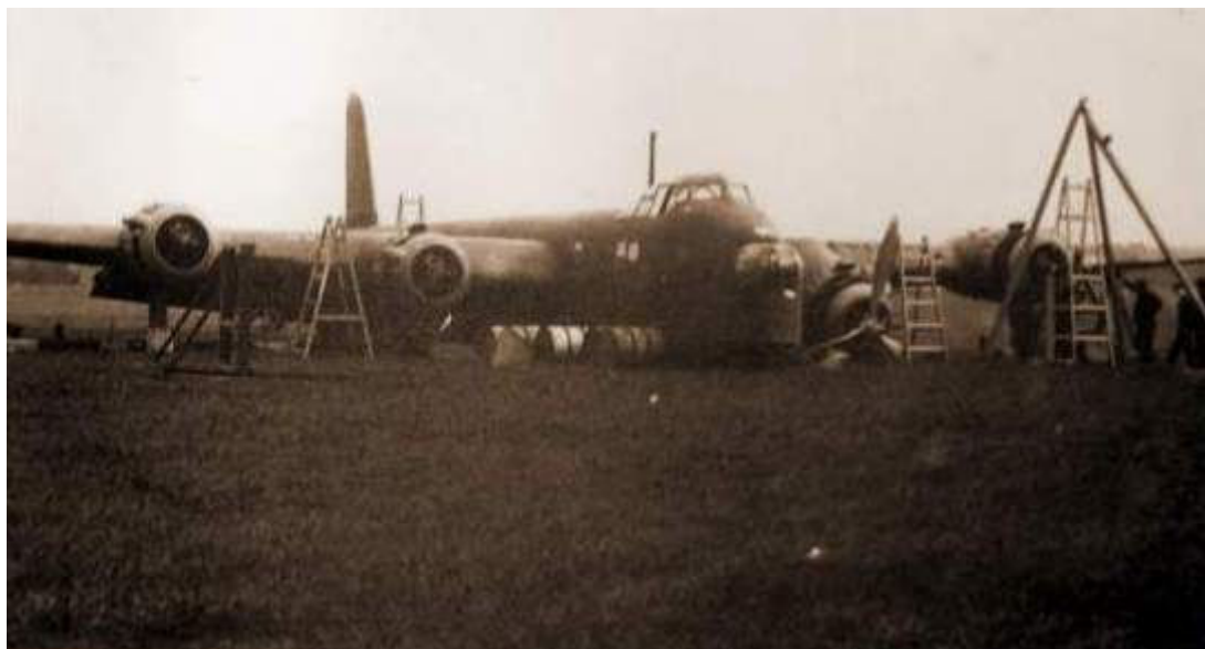
Left: The prototype Stirling L7600 at Rochester on 14 th May 1939 showing the collapsed undercarriage

North Kent saw the first operation of aircraft on and from ships, the first in-flight refuelling and the first heavy bomber of the Second World War, namely the Stirling. Unfortunately its specification was produced by a camel in the form of an Air Ministry Committee. It required, for example, that the wing span of the Stirling should be less than 100 feet – simply because that was the width of existing RAF hangars. The Committee's subsequent amendments and additions to the specifications sadly eroded the Stirling's performance and although more than 400 Stirling were produced at Rochester they never achieved the success of the Lancaster which was not subject to the same design problems. The first flight of the Stirling from Rochester Airport ended in the collapse of the undercarriage (see the photograph below) for which there are differing explanations. The most plausible is that the requirement to increase the height of the under-carriage in order to achieve short takeoffs resulted in an initially weak design. The Shorts' design team went on to develop unique expertise but when, at the end of the Second World War, the company was removed to Belfast, it lost the opportunity to expand into civil aviation. As a result one of its designers set up a local company and patented the air stair door which became an almost universal feature of airliners until adoption of the current system of an articulated airport access.